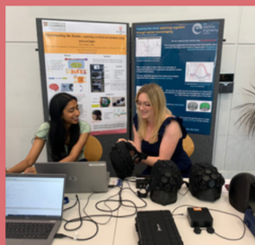
Engineering Open Days Outreach